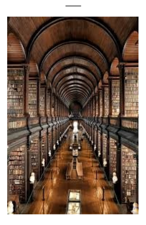
Trinity College Library

The Book of Kells was brought to Dublin for safe-keeping and it has been in the possession of Trinity College since at least 1661. The book has been on display in Trinity College's Old Library since the middle of the nineteenth century and attracts an average of 500,000 visitors each year.