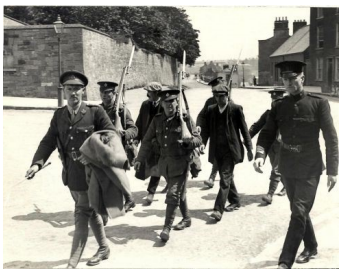
Prisoner off to Kilmainham Gaol