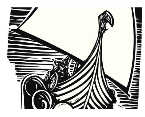
<u>New Viking Discovery in County</u> Louth

A tiny County Louth village is home to one of the most important Viking sites in the world.