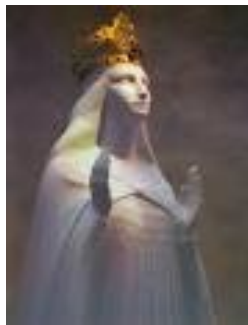
Our Lady of Knock