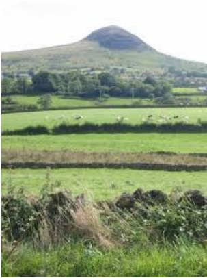
Slemish Mountain The legendary first home of st. Patrick.