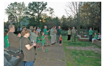
Some of our crowd watching the dancers!