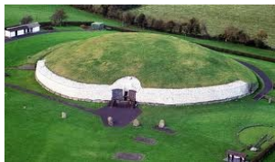
Aerial view of Newgrange, located in the Boyne Valley, County Meath, Ireland