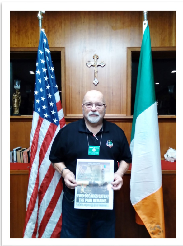
The Daily News says it best.....