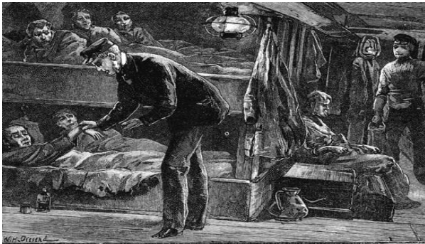
Irish emigrants boarded "coffin ships" in the 1800's

The initial remains that were discovered in 2011 on a beach in Forillon National Park, Quebec, were identified as two seven-year-old boys and an 11-year-old boy.