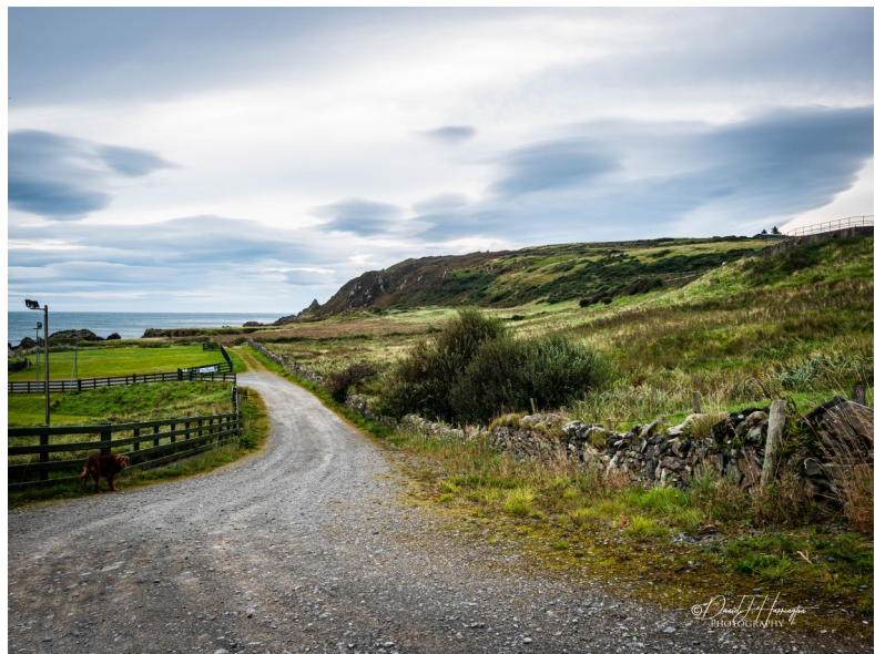
The Road to Kinnegoe Beach, Donegal

Since that time we continue to grow, adding new members and supporting and donating to Catholic schools and Churches in the area, in line with our commitment to Friendship, Unity and Christian Charity.