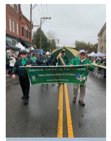
The Parade is On!