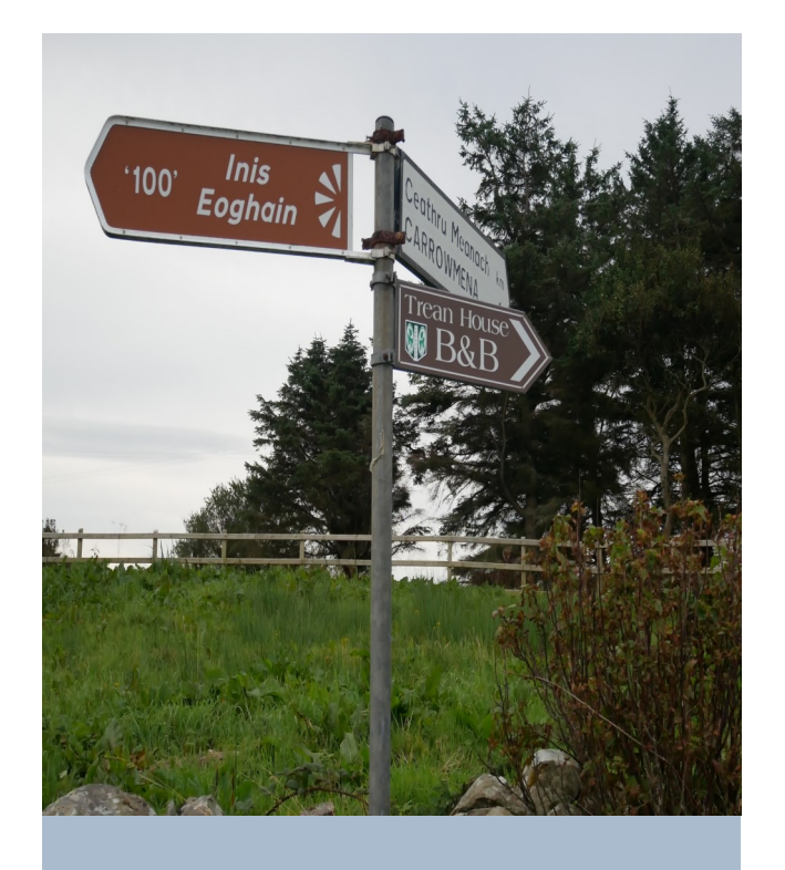
The Way to the Trean B&B. Co. Donegal