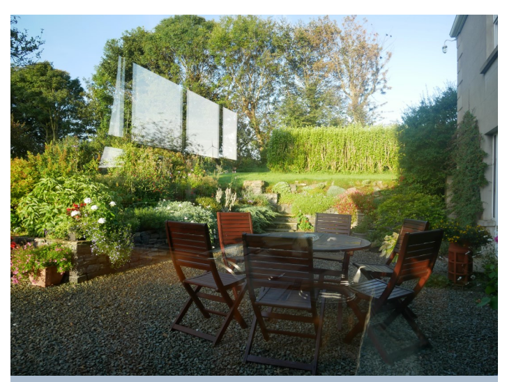
A Beautiful Evening