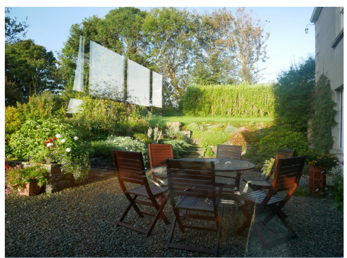
A Beautiful Evening