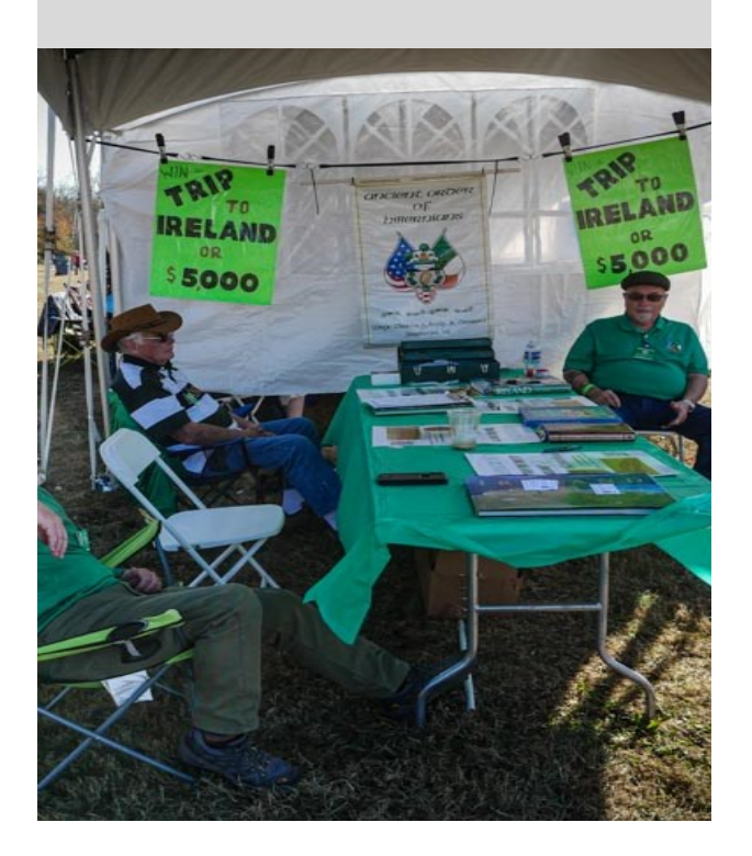
A tough day selling those raffle tickets. Time to relax!

In Italy: BOBBIO (f. 612), Taranto, Lucca, Faenza, Fiesole.