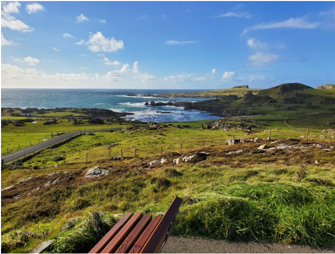
View to the west from northern Donegal